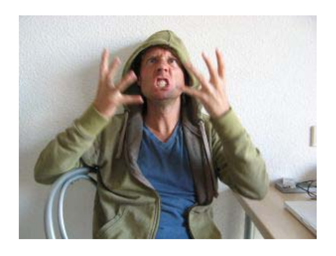
Negate Negativity Dealing With Negative People And Bringing The Positive Out Of Them

Negativity almost always results in something less that desirable. Learning to understand and control the negativity within one's own life should be taken seriously and as a first step to making the necessary improvements to change the bad habit. When this is achieved then and only then can an individual take it upon themselves to try and defuse other possible negativities. You'll get all the tools here.